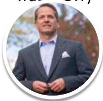
Mr. Frank Edelblut Commissioner of Education, Department of Education of the State of New Hampshire, US