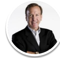
Mr. Neil Bush Chairman of Bush China US Relations Foundation