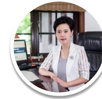
Ms. Jing Jing Deputy Mayor of Chengdu, Former Deputy Secretary of Party Committee of Sichuan U.