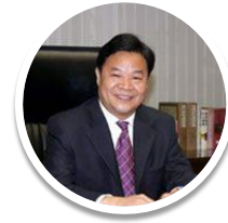
Mr. Lv Xinhua President of Council for Promoting South-South Cooperation, Former Minister of Foreign Affairs